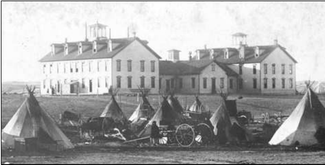
U.S. school for Indians, Pine Ridge, S.D. 1891

~ Captain Richard Henry Pratt, Founder, Carlisle Indian School, PA